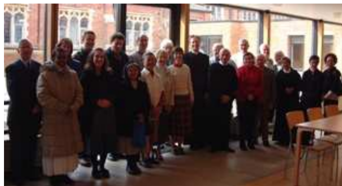
(Picture: Lenten retreat 2009 at Douai Abbey)

Reading. We also continue our St Bruno prayer group for men every first Friday and our catechism day every first Saturday. We now regularly email the Mass times for the following week to those who attend Mass in Reading. This should encourage more people to come to church even on week days. In Lent we also have Stations of the Cross every Friday. Our Lenten programme (already started) is quite intense as you will read below. It will culminate at Holy Week with the full liturgies in the solemn rite, with the help of a seminarian from Wigratzbad.