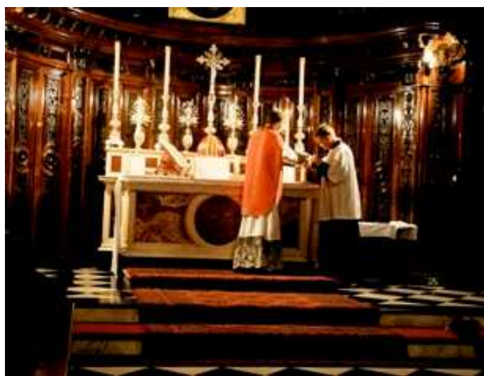
( : Mass in Little Oratory, London, at launching of FSSP DVD)

Despite snowbound railways and roads, it is a pleasure to be gathered here tonight in St Wilfrid's Hall at the London Oratory for a presentation of the tutorial DVD made in collaboration with EWTN and the FSSP. I would like to start by thanking the Rev Fathers of the London Oratory for having graciously allowed the Priestly Fraternity of Saint Peter to organize this event within their premises. There is a long friendship between the Oratory and the FSSP: first, because as the Oratory of St Philip Neri was historically the very first "clerical society of apostolic life" – a status of "religious without vows", so to say, which the FSSP has in common with them – this makes the Oratory our "ancestors" canonically speaking; second, because the Holy Father Pope Benedict has entrusted to the care of the FSSP in Rome the personal parish of the Most Holy Trinity of the Pilgrims, founded by St Philip Neri himself to shelter the pilgrims in Rome.