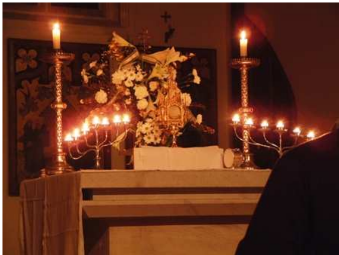
(Picture: Adoration during Vocation retreat, Douai Abbey, January 2009)

The English were now caught between the Celtic missionaries operating from Scotland and the Roman missionaries in the South of England. One of the most famous Celtic missionaries around that time was St Aidan who founded the monastery of Lindisfarne, off the coast of Northumbria, in 635 AD. In time the whole of England was converted and English missionaries joined the Irish monks in the conversion of pagans in Europe. Now the Celt and the English had a common faith, the Christian faith, the Catholic faith and a common purpose.