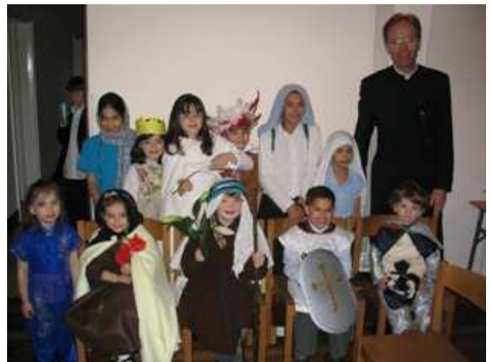
(Picture: children dressed as their patron saints on All Saints 2008, Reading)

Over and above this, as Canon Law requires, there is a parish finance committee which meets regularly, with a team of collection counters. Also there is a Parochial Pastoral Council, chaired by the Parish Priest, which meets two or three times a year, to discuss any important parochial issues which the clergy identify.