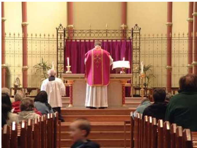
(Picture: Fr de Malleray offering Mass in Portsmouth cathedral at LMS recollection on March 14, 2009)