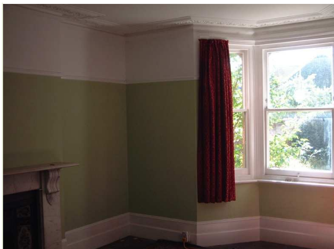
(Entrance, drawing-room, kitchen and bedroom.)

Our offer for a larger house as advertised in the previous issue of Dowry had been rejected. However, the one we have bought still allows us to have a fairly spacious and stable base for our ministry across England and Wales. Walking to the church takes between 5 and 10mn.