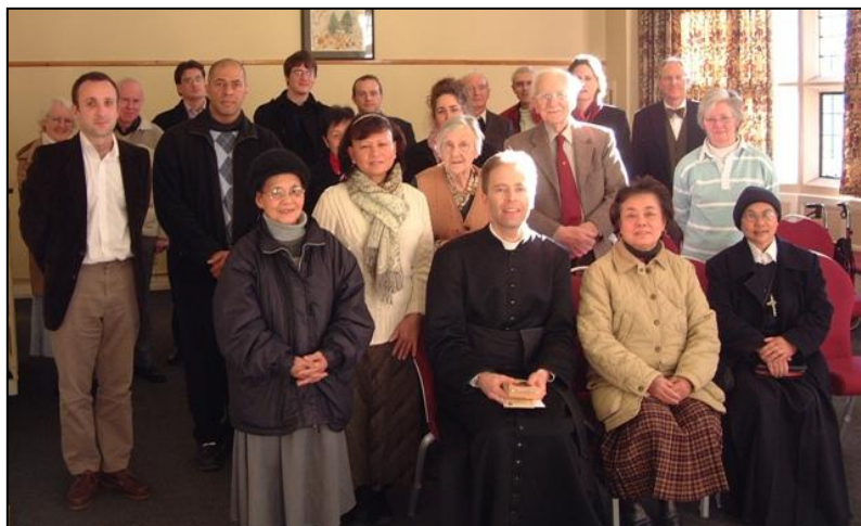
(Participants in the Lenten week-end of recollection 2010)

The Lenten week-end of recollection at All Saints Pastoral Centre (London Colney, North London) on 5-7 March 2010 was well attended with 24 adults taking part, four of whom not staying the night. The theme 'The Four Last Things: death, judgment, hell and heaven' was a very grave one and very appropriate to prepare for the Sacred Triduum. The dates were intentionally chosen on a week-end, so as to allow those who work during the week to attend. There can be no doubt that a good retreat – even a short week-end – is highly profitable for our spiritual growth. For those who like the Extraordinary Form of the Mass but may not have it available where they live, it is also a unique opportunity to be refreshed with this