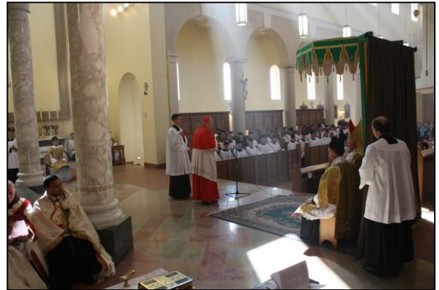
(Cardinal Levada conveys the Holy Father’s encouragements to the Priestly Fraternity of St Peter)

His Holiness prays that the new chapel will always be respected as a sacred dwelling where Almighty God is glorified in His majesty, a centre from which the beauty