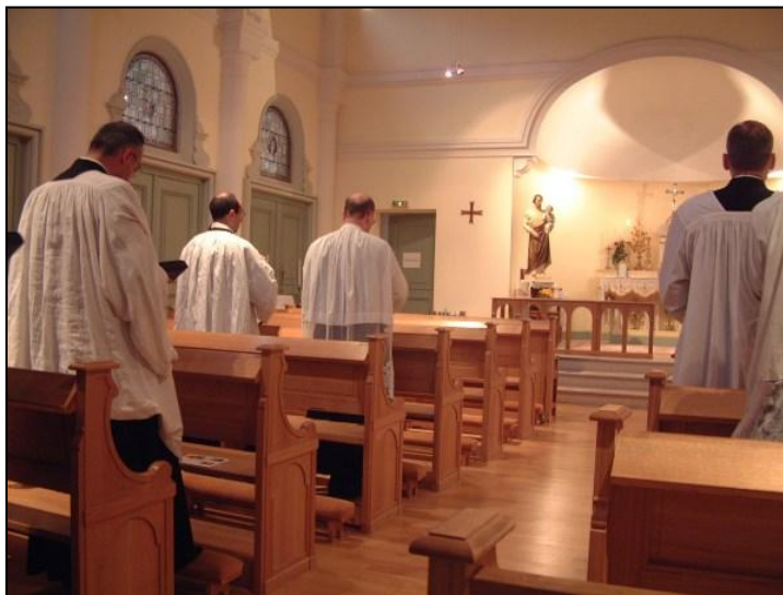
(We sang Compline every evening according to the EF breviary in the lovely chapel at St Padre Pio House)

On Thursday we headed off to Ars for the day. I'm delighted to report that not only was there no problem arranging for our group to celebrate the EF in the church at Ars but the sacristy even provided altar cards and missals. As we entered the church I could hear a Missa Cantata being celebrated on the altar above which the body of the saint is on display. This was being celebrated by a priest of a new group, the Missionaries of Divine Mercy from Toulon, which seem to be modelled on the White Fathers. There were a number of priests of the group with a large group of faithful. I'd never been to Ars before and hadn't realised that while the nave of the original parish church has been preserved the sanctuary has been removed and